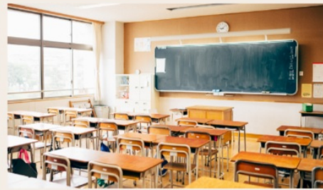
Memories of our school days.