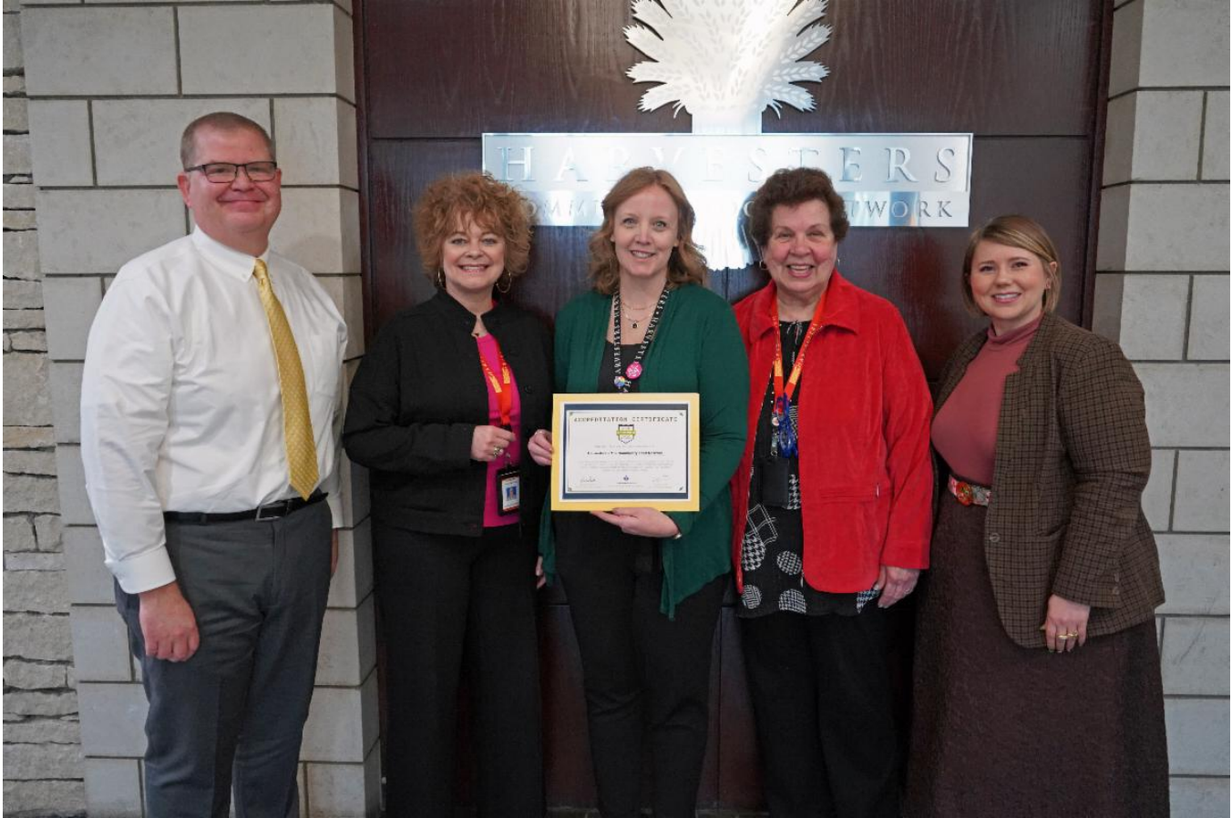
Harvesters staff pictured with Service Enterprise accreditation certificate.